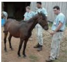
“Wee Willie Hitchcox” on arrival

Donations in the amount of $1,000 - $2,499 will be recognized at this level.