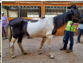
Milton - released