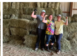
HHT Hay Crew