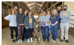
University Family Physicians