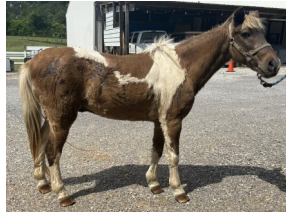
Dino - released