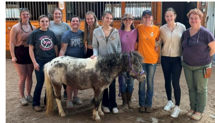
UT Pre-Veterinary Association Team

So many wonderful folks donated their time to help out around the barn getting it ready for a new year. These guys rock!