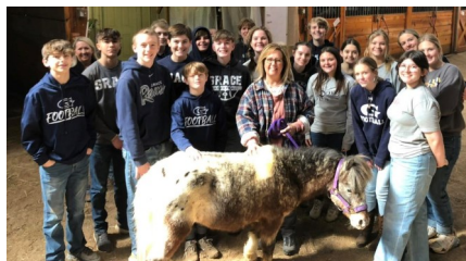
Grace Christian Academy